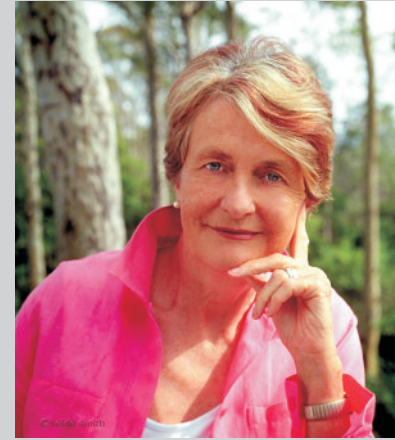
Dr. Helen Caldicott

“Dr. Caldicott’s passion, knowledge and conviction are unsurpassed.”